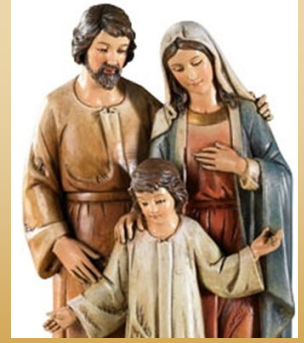
Holy Family Church 2 S Maddy St. McGregor www.mcgregorcatholicchurch.org

Office Hours: M-Th 9am-5pm, Fri. 9am-Noon Phone: 218-927-6581 Fax: 218-927-6589 Email: office@aitkincatholic.org Mailing Address: 299 Red Oak Dr., Aitkin, MN 56431 Connect to Holy Family and St. James Church via Facebook