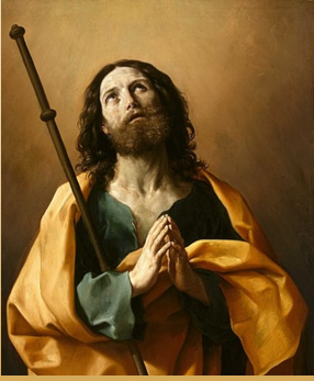
St. James Church 299 Red Oak Dr. Aitkin www.aitkincatholic.org