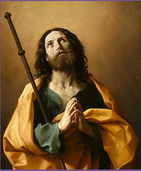
St. James Church 299 Red Oak Dr. Aitkin www.aitkincatholic.org