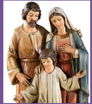
Holy Family Church 2 S Maddy St. McGregor www.mcgregorcatholicchurch.org

Connect to Holy Family and St. James Church via Facebook