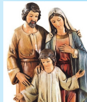
Holy Family Church 2 S Maddy St. McGregor