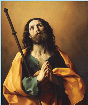
St. James Church 299 Red Oak Dr. Aitkin