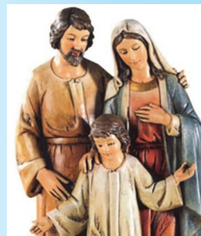
Holy Family Church 2 S Maddy St. McGregor

Mailing Address: 299 Red Oak Dr., Aitkin, MN 56431