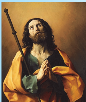
St. James Church 299 Red Oak Dr. Aitkin