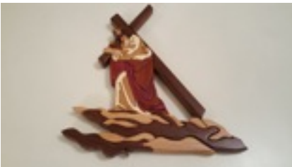
Jesus Carries His Cross